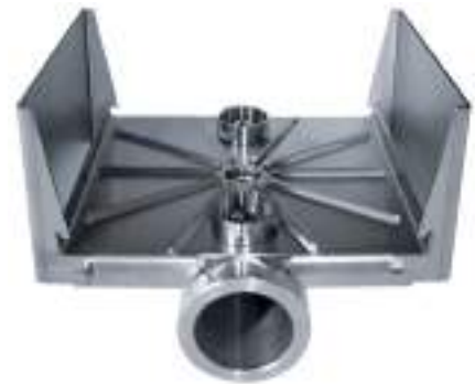
FlueFire burner head