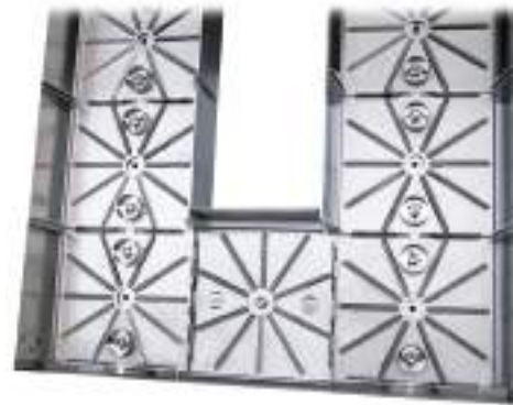
Flame propagation plate connects burner rows