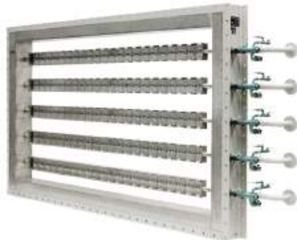
FlueFire duct unit

ECLIPSE ® Innovative Thermal Solutions www.eclipsenet.com