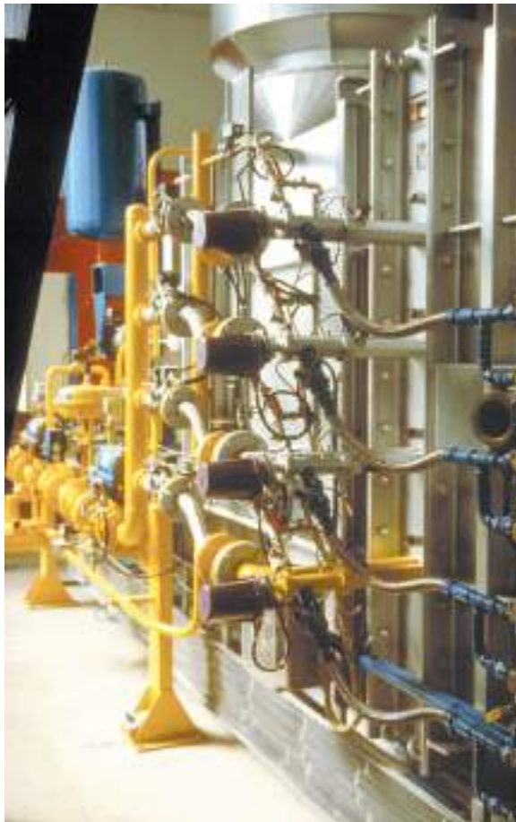
FlueFire system installed in a cogeneration plant